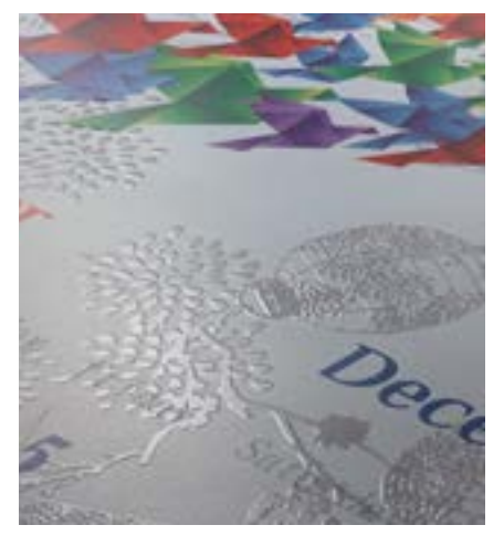
Raised print produces eye-catching, tactile effects.