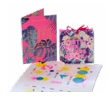
HP Indigo ElectroInk Fluorescent pink for high-value pages.

Use HP SmartStream products and partner solutions with the HP Indigo 7800 Digital Press to improve production efficiency and support digital growth. To learn more visit hp.com/go/smartstream